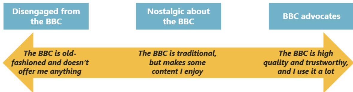
Figure 2: Range of views about the BBC

This is not intended to be a comprehensive typology of public attitudes to the BBC, but rather to highlight the broad range of perceptions and current experiences. The examples outlined in more detail are designed to illustrate these groups, but the examples are not reflective of all those in each broad category. For example, some of those who highly value the BBC do not use BBC Radio, while some older people are more negative about the BBC and have little nostalgia for past programmes.